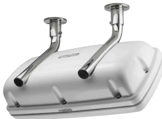
Shown: GP1040 SystemPod on SK129 Stanchion Kit. (Back shot of photo on left)

SystemPods are for mounting multiple pieces of electronics into a single NavPod. A Radar or Chartplotter can easily be mounted along side Autopilot or Instrument displays.