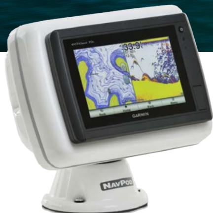
PowerPod PP4400 Series for popular 7" displays