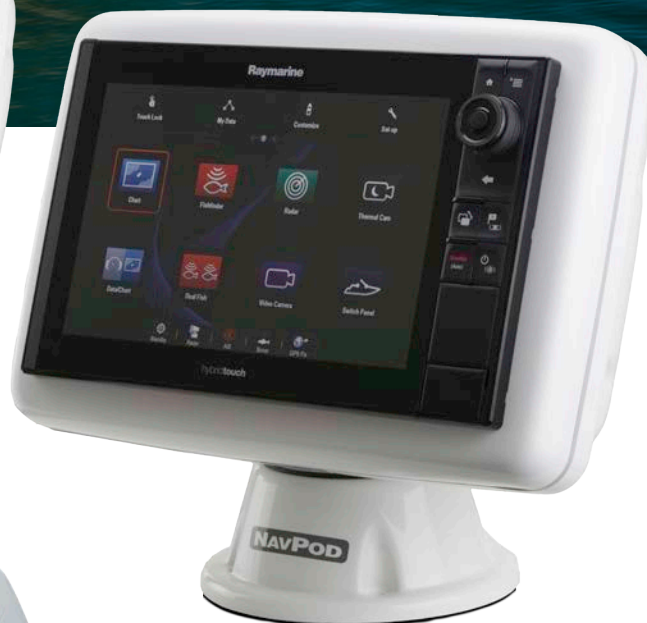
PowerPod PP5200 Series for most 12" displays