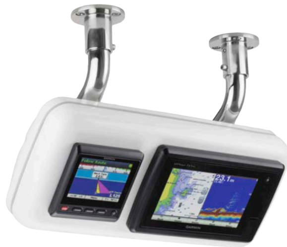
Shown: GP1500 SystemPod on SK125 Stanchion Kit