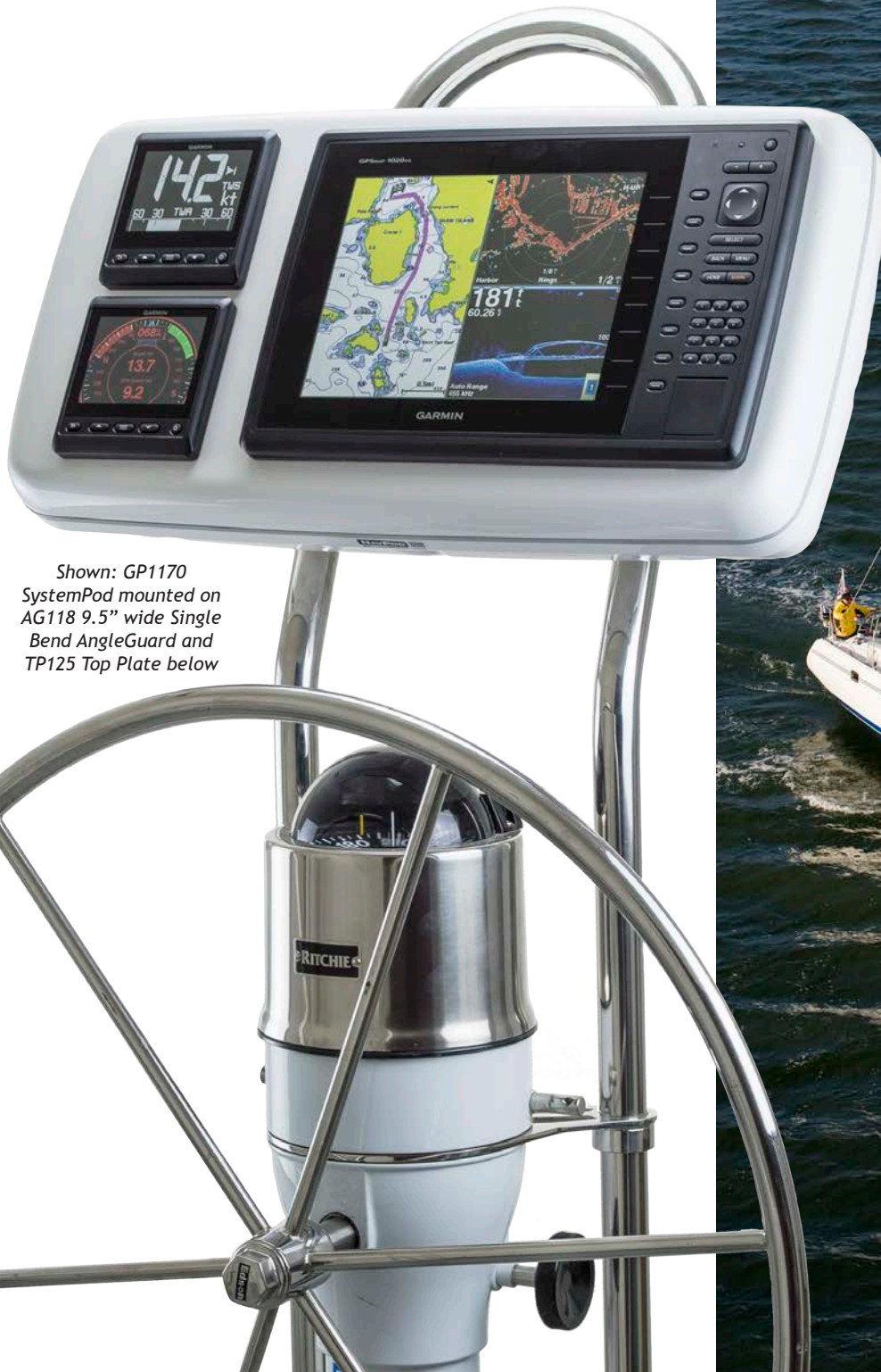
Shown: GP1170 SystemPod mounted on AG118 9.5" wide Single Bend AngleGuard and TP125 Top Plate below

SystemPods are for mounting multiple pieces of electronics into a single NavPod. A Radar or Chartplotter can easily be mounted along side Autopilot or Instrument displays. Models available to fit 9.5" or 12" wide AngleGuards.