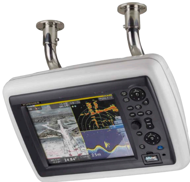
Shown: GP1030 SailPod on SK130 Stanchion Kit

This is a very strong, sturdy and secure way to mount electronics in the overhead area where an overhead box does not exist. Find the right SystemPod for your electronics, then choose the correct Stanchion Kit for that SystemPod. The SystemPod will be positioned at 40 degrees off the vertical axis. There are 3 different Stanchion Kits for different size NavPods and over 200 Pre-Cut SystemPods (or SailPods) to choose from. SystemPods are for multiple pieces of electronics and SailPods are pre-cut for a specific Radar, Chartplotter or Fishfinder. The NavPods with 9.5" spacing on the back are recommended.