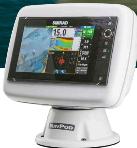
PowerPod PP4800 Series for 8" and 9" displays