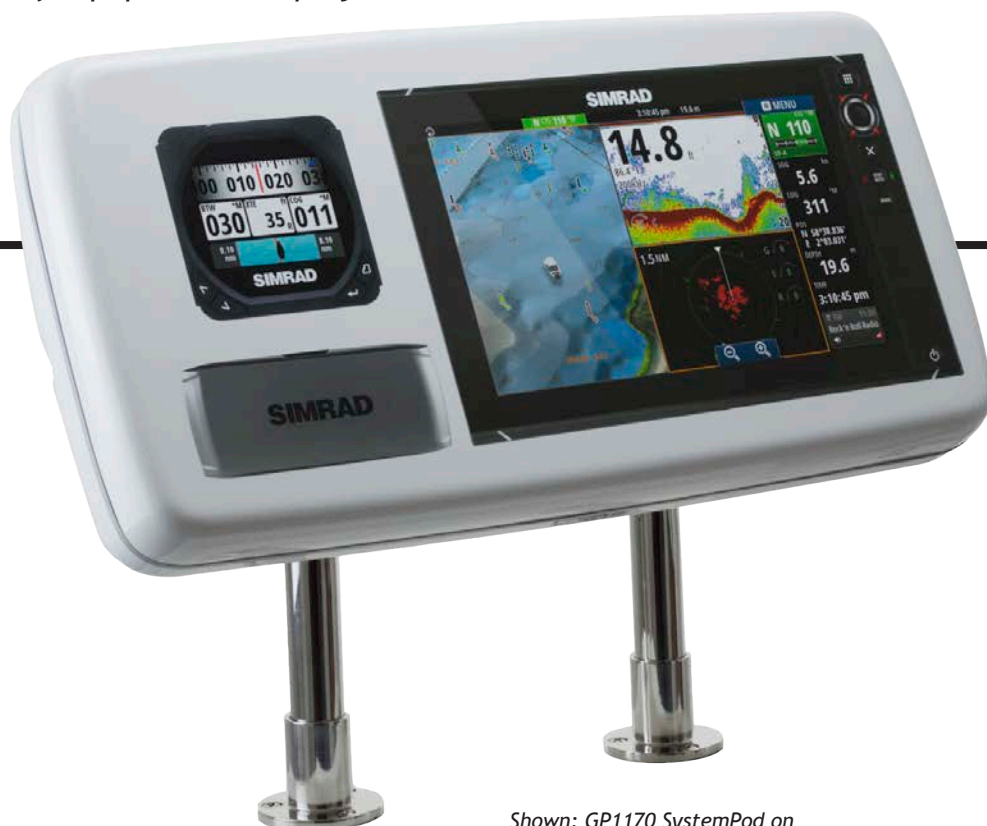
Shown: GP1170 SystemPod on SK135 Stanchion Kit